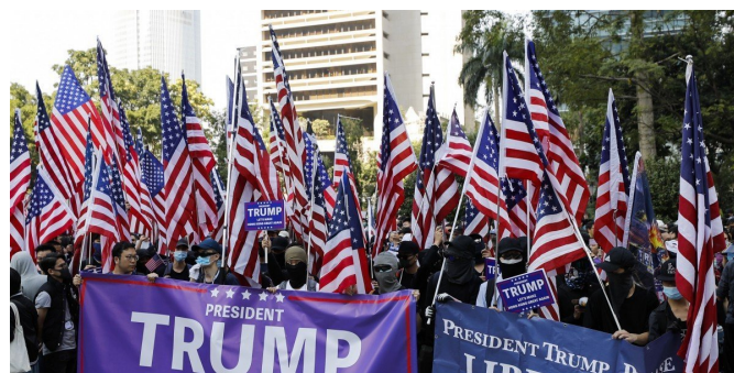
Pro-Trump protesters in Hong Kong

America’s far right eagerly embraced anti-Chinese, pro-Trump protests in Hong Kong. The feeling was mutual.