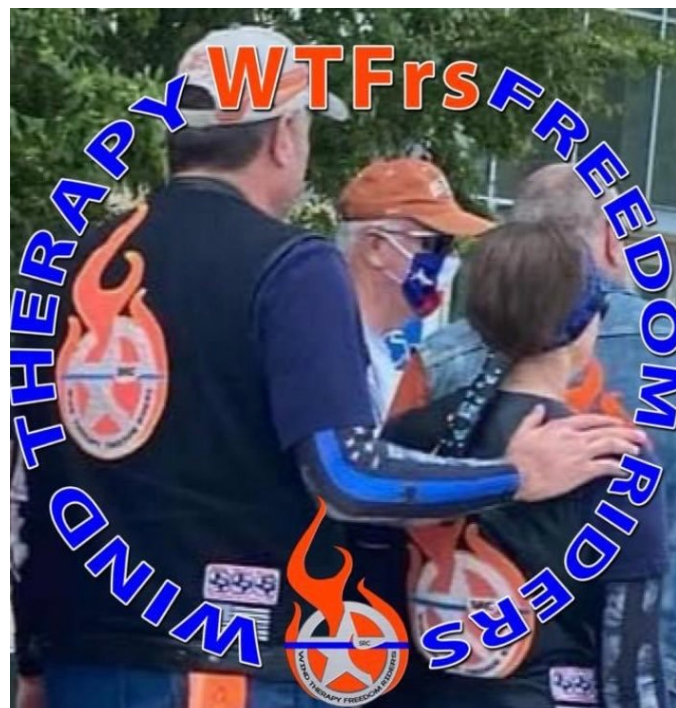
Wind Therapy Freedom Riders at Department of Corrections

In addition to former and active police and prison guards, Wind Therapy Freedom Riders (WTFers) often display a fondness for the Confederacy