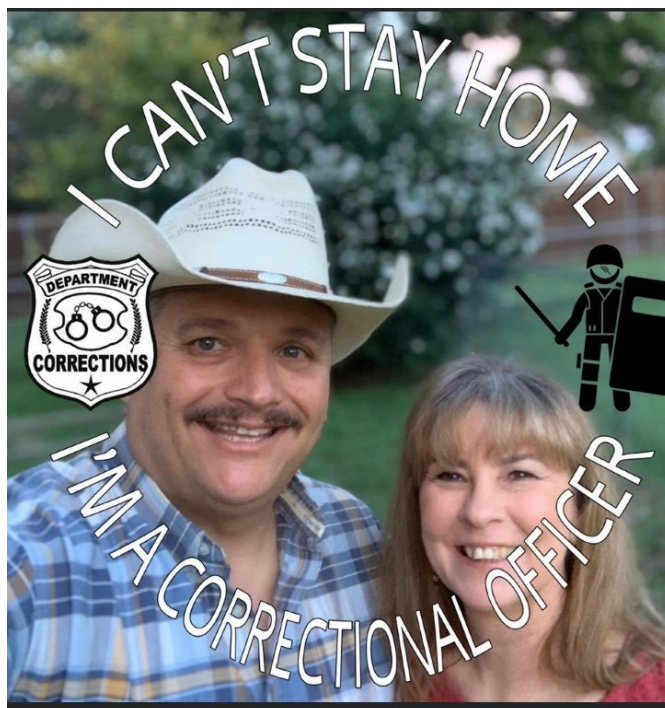
Wind Therapy Freedom Riders at Department of Corrections