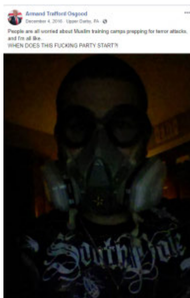
My man can't WAIT to shoot muslims