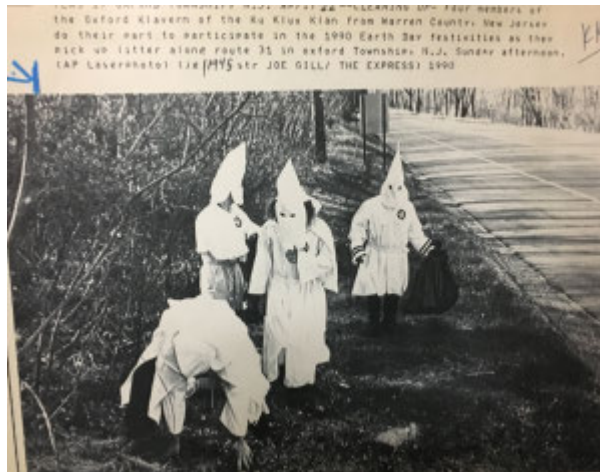
Turns out anyone can pick up trash though