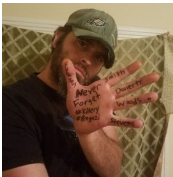
Get over it already