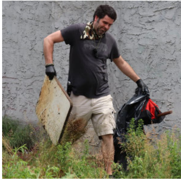
Picking up Trash