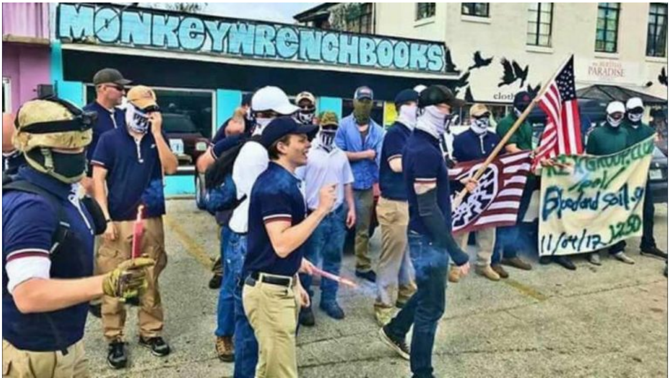
Members of Patriot Front, many wearing their navy uniform shirts, protest outside Monkeywrench Books in Austin, November 2017.