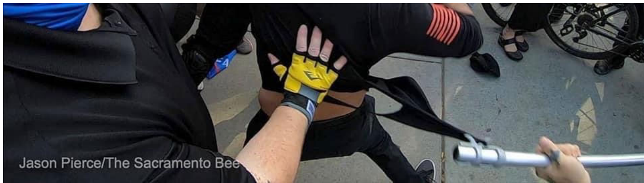
Proud Boys & other far-right assailants engaging in a mob assault of an anti-racist protester at a Sacramento "Stop the Steal" rally.