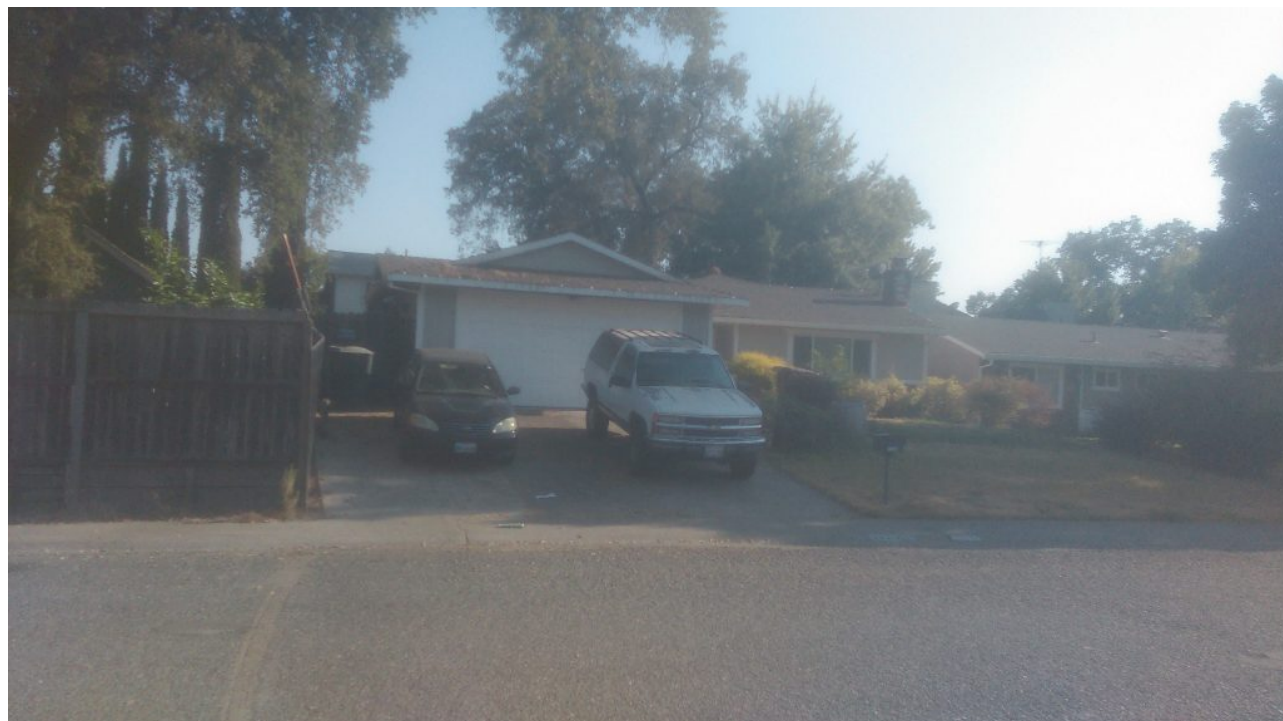
Jeffrey's current residence in Orangevale.