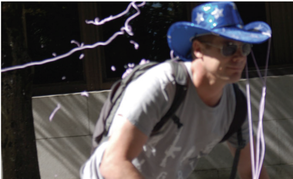
One of the few Patriot Prayer followers who showed his fawning face in Portland on 9/10 retreats in dismay