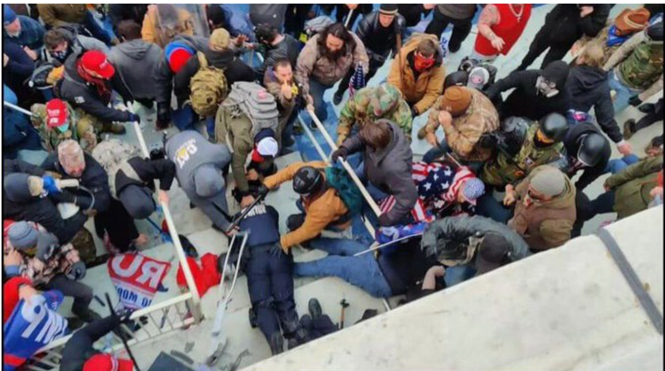
The far-right beating a cop to death on their way to storming the US Capitol on January 6th.

In addition to the racist instances of property damage, Proud Boys also engaged in physical violence with those living in and around the area. There were numerous instances where individuals were chased and surrounded by large groups of Proud Boys who had come from all over the country (including Northern California) to swarm DC. The events of the weekend of December 12th also directly built towards what occurred in DC on January 6th .