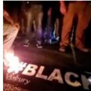
A few moments later, that same banner is burned by Proud Boys in the street.

In addition to the racist instances of property damage, Proud Boys also engaged in physical violence with those living in and around the area. There were numerous instances where individuals were chased and surrounded by large groups of Proud Boys who had come from all over the country (including Northern California) to swarm DC. The events of the weekend of December 12th also directly built towards what occurred in DC on January 6th .