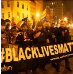
Proud Boys in Washington, DC, hold a Black Lives Matter banner ripped from a historically black church

of cross burnings. Seeing this act on video made me both indignant and determined to fight the evil that has reared its ugly head. We had been so confident that no one would ever vandalize the church, but it has happened.”