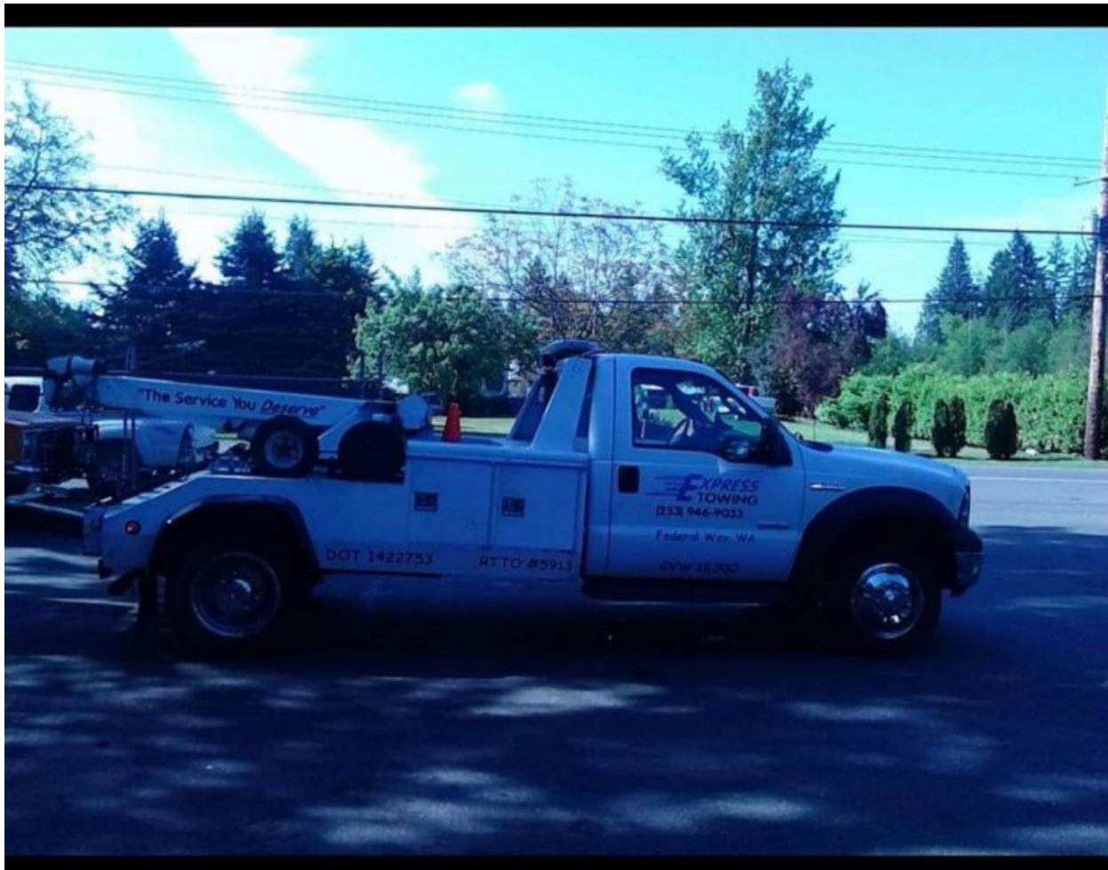
Photos from Matt’s social media shows he is employed at: Express Towing Federal Way, WA (pictured below)