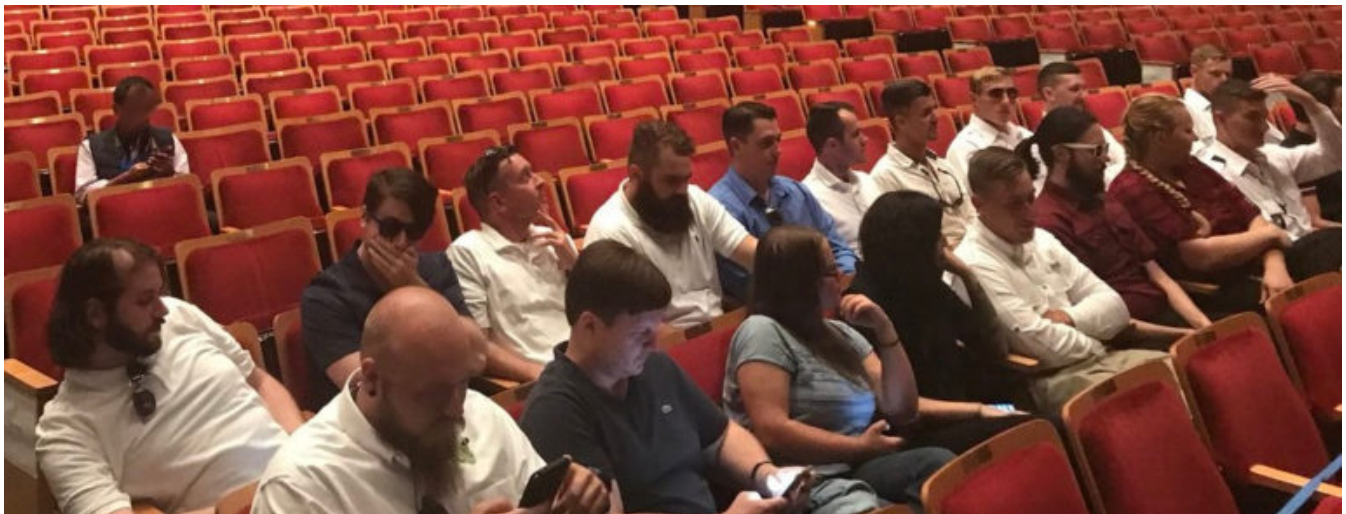
Small numbers of white power militants sitting in front rows at Richard Spencer's University of Florida event before rest of audience admitted

On October 19, white nationalist leader Richard Spencer held a speaking event at the University of Florida campus in Gainesville. Spencer was met by a large anti-fascist mobilization organized by the #NoNazisAtUF coalition and supported by anti-racists from throughout the South . The event was a clear victory for anti-racists. Spencer was jeered and frequently drowned out from inside the venue , and ended his event ahead of schedule. Two thousand protesters simultaneously rallied outside, with many in the crowd confronting and chasing the white supremacists who showed up for Spencer. The University of Florida spent approximately $600,000 to protect the white power leader ; the Governor declared a State of Emergency ahead of time ; but a broad-based anti-racist/anti-fascist coalition nevertheless won the day.