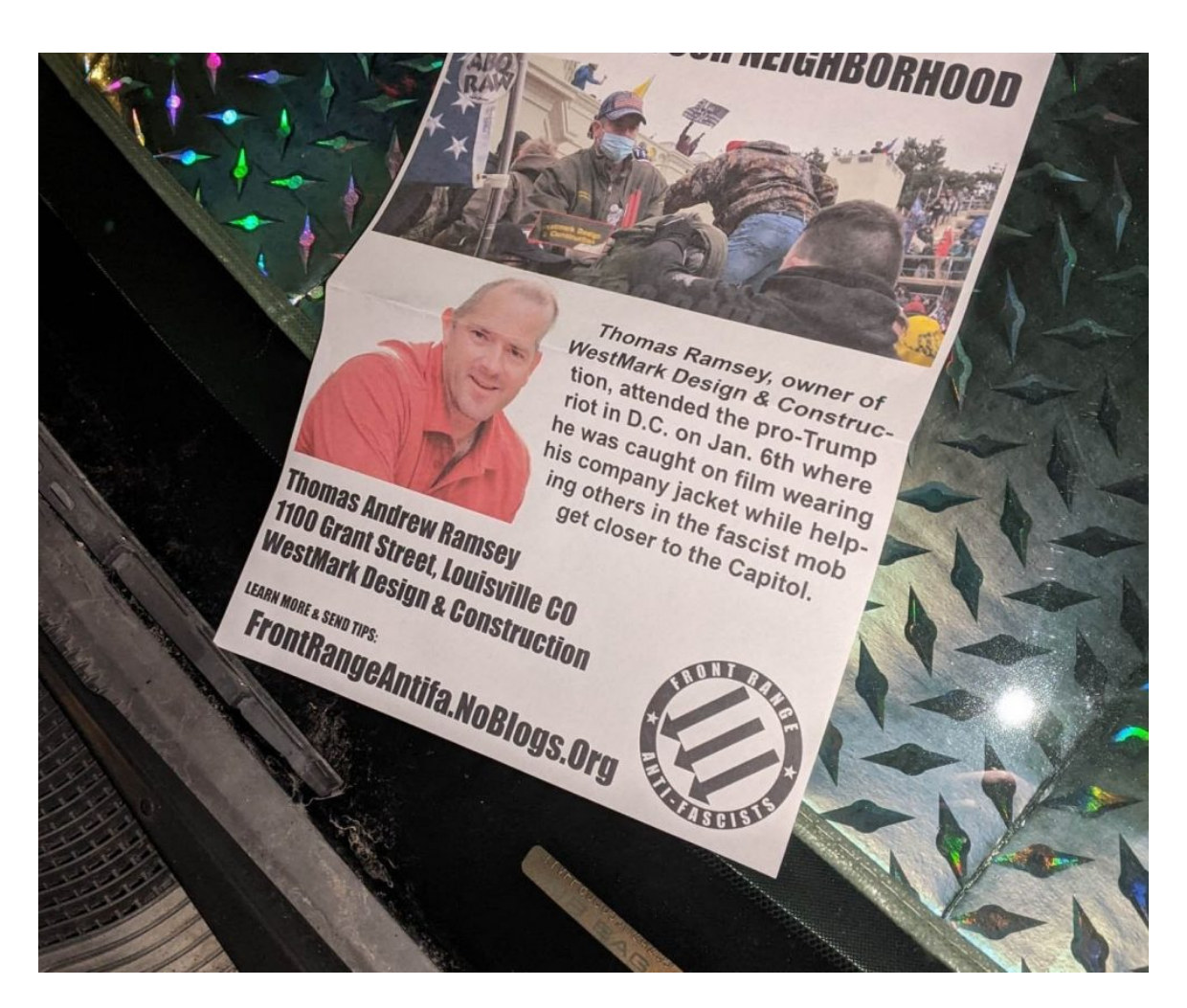
Download a copy of the flyer to <a href="mailto:printhere">print here < https://upload.vaa.red</a> /Lvw2w#6aa548e33075c259bf1476b29820e318>